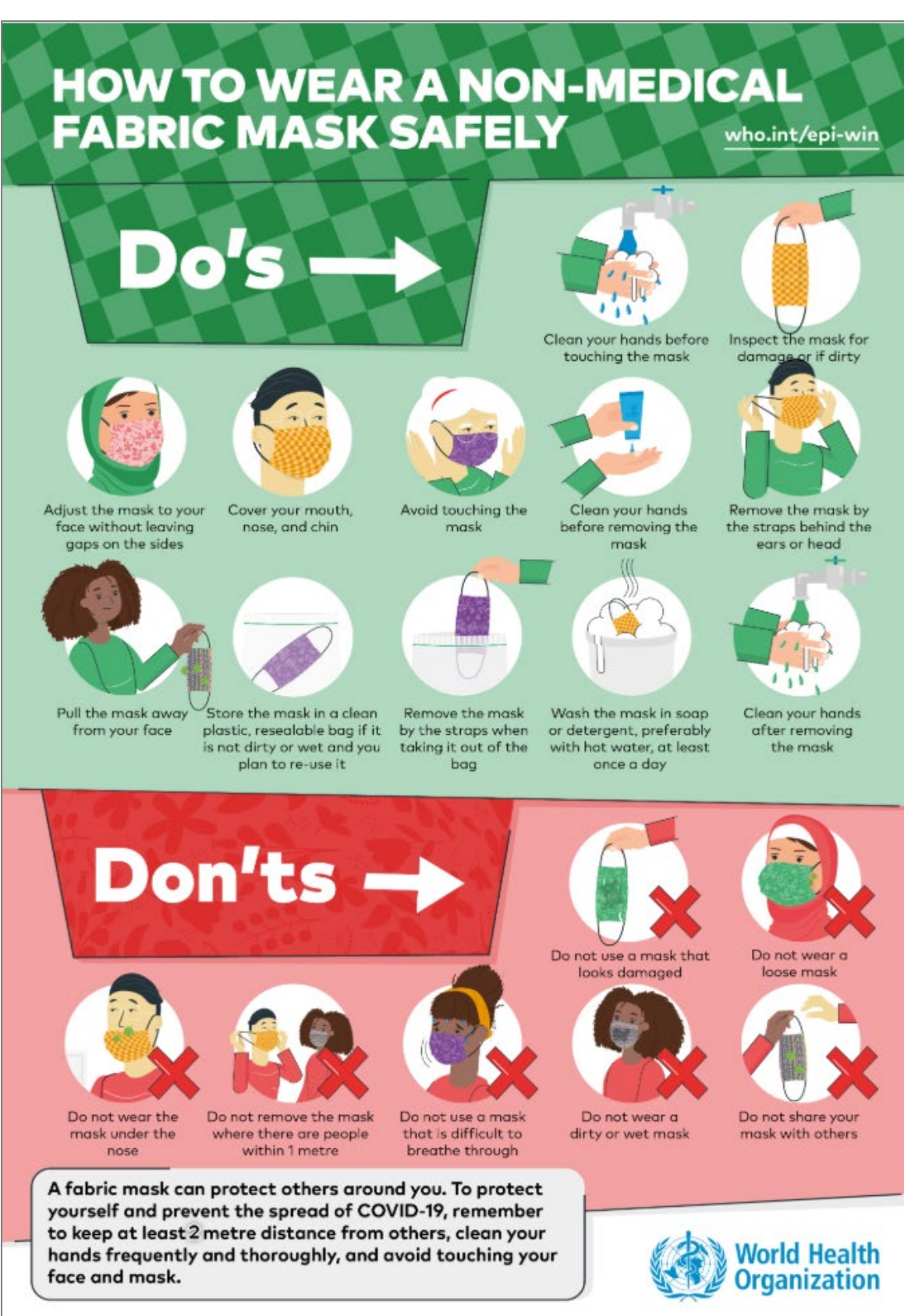
(Non-Medical Fabric Mask) *Poster modified to 2 metres