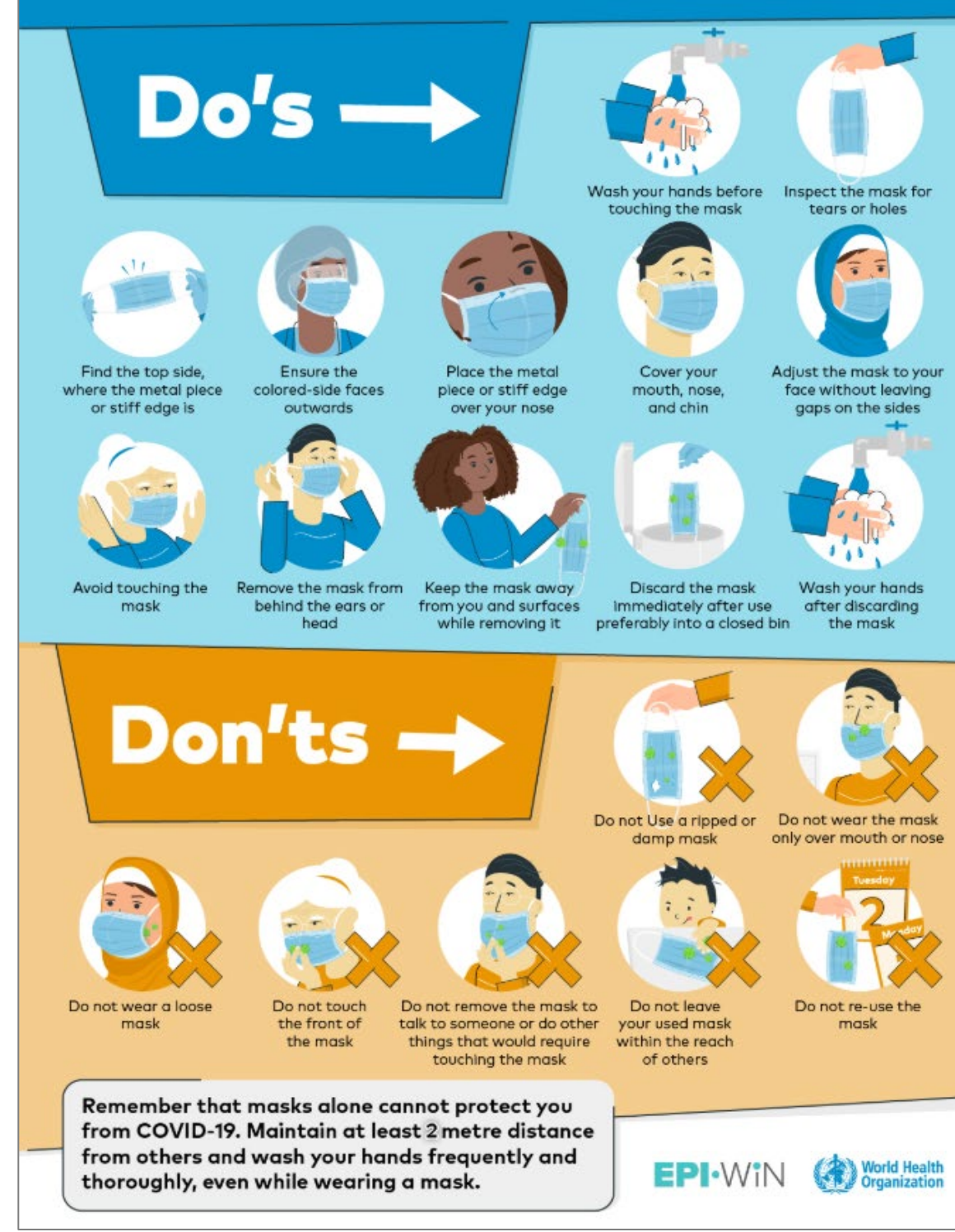
(Medical Mask) *Poster modified to 2 metres