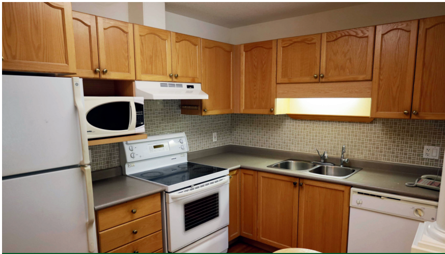
Kitchen with generous cabinet space and functional layout