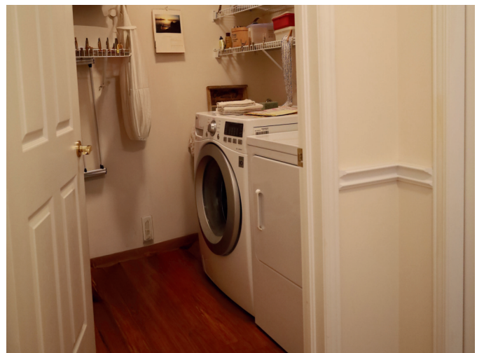
Main floor laundry for convenience