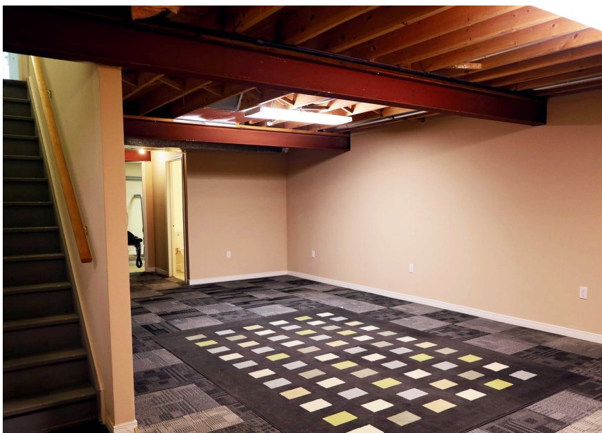
Partially finished basement for hobbies, storage, or additional living space