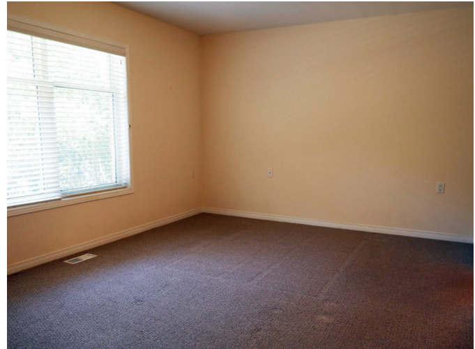
Bright master bedroom with large windows