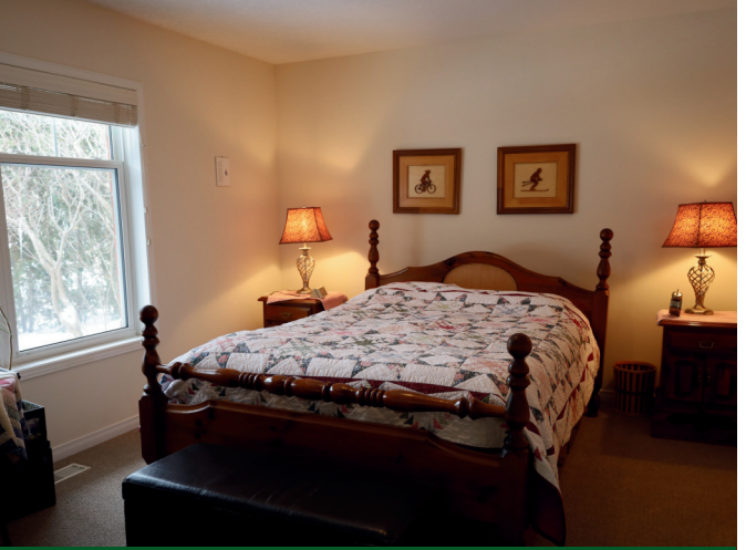
Bright master bedroom with large windows