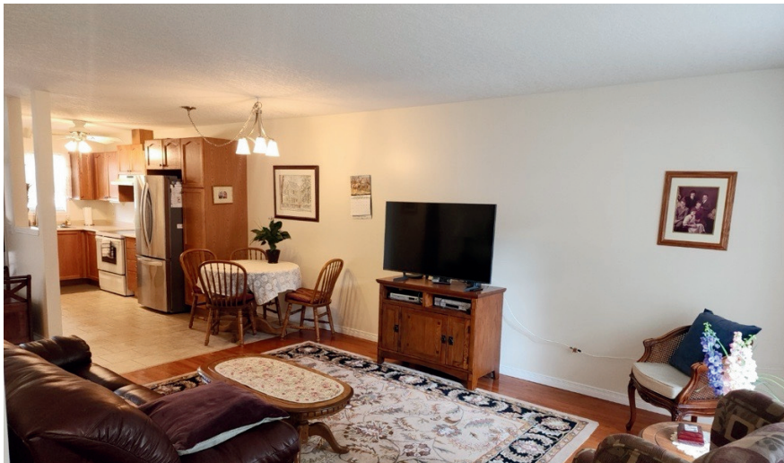
Bright open-concept living and dining area