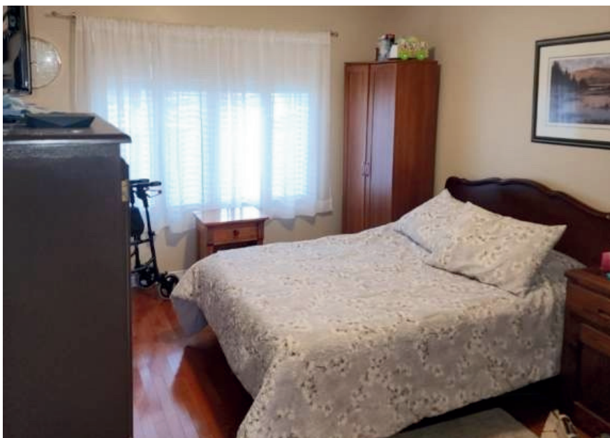
Bright and comfortable bedroom with generous space and natural light