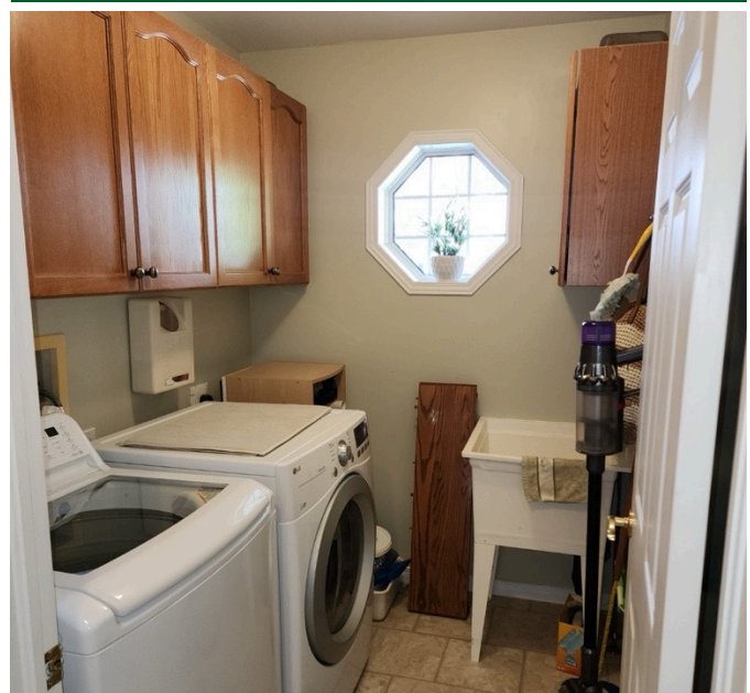
Main floor laundry for convenience