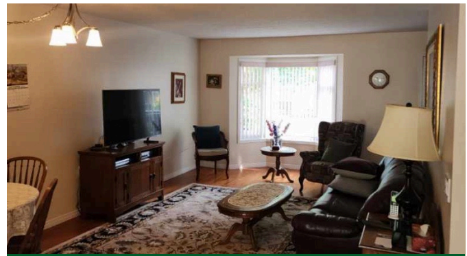
Carpet free flooring