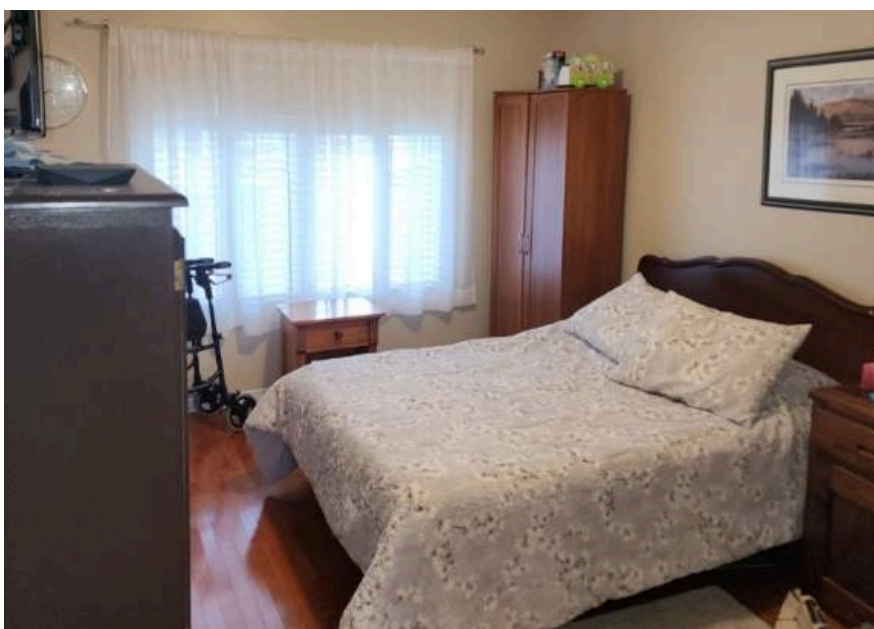
Bright and comfortable bedroom with generous space and natural light