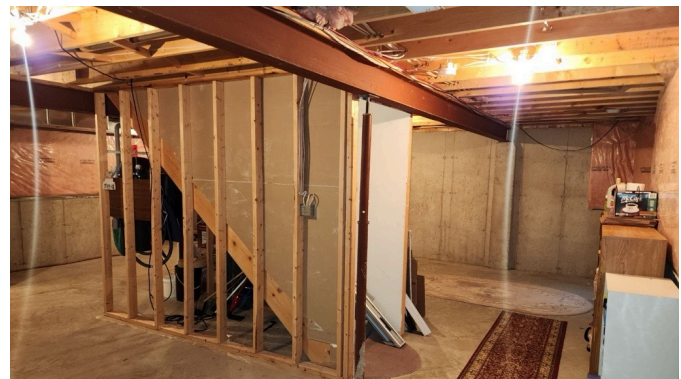
Unfinished basement with potential for customization