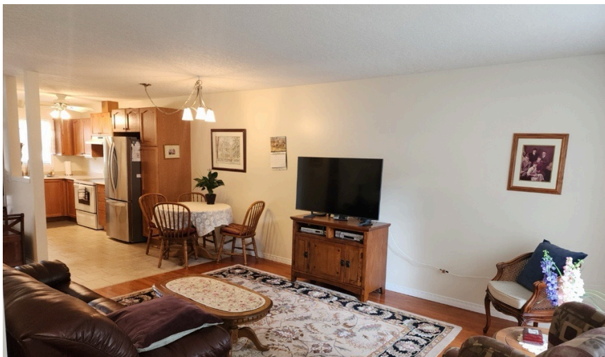
Bright open-concept living and dining area