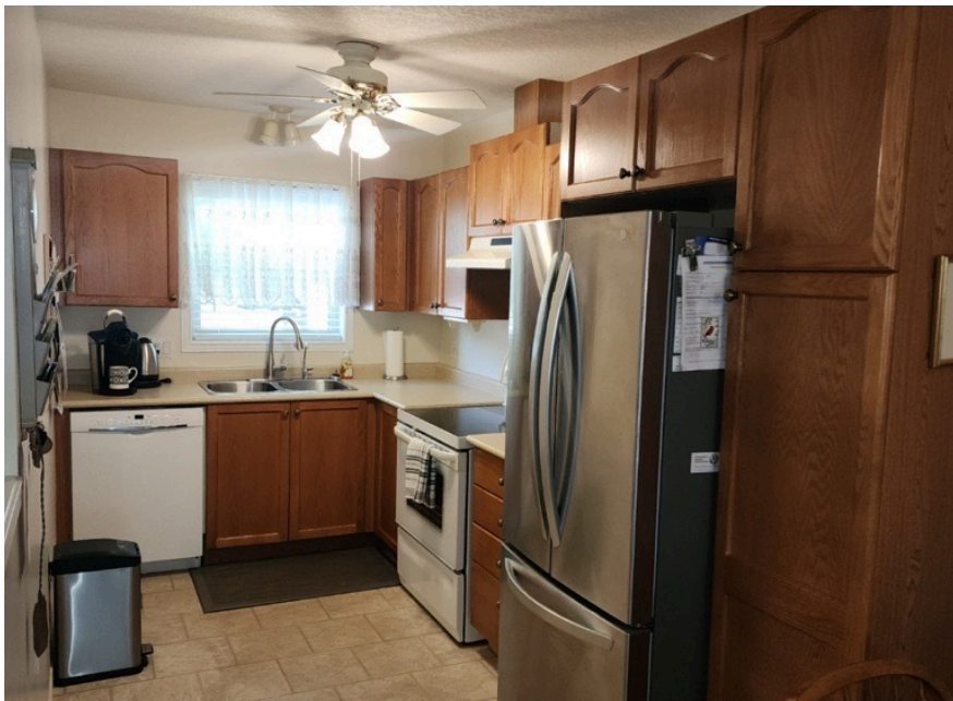
Kitchen with generous cabinet storage and five appliances included