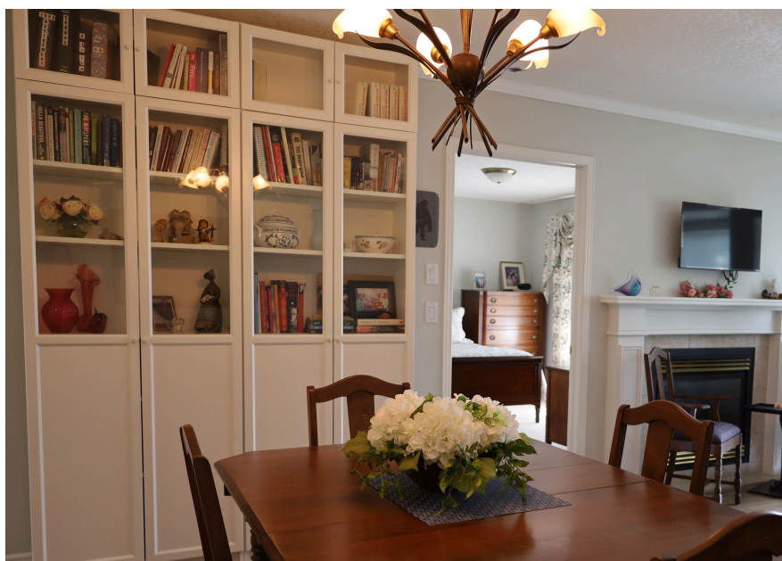
Custom china cabinet and gas fireplace in the living room for added comfort and ambiance