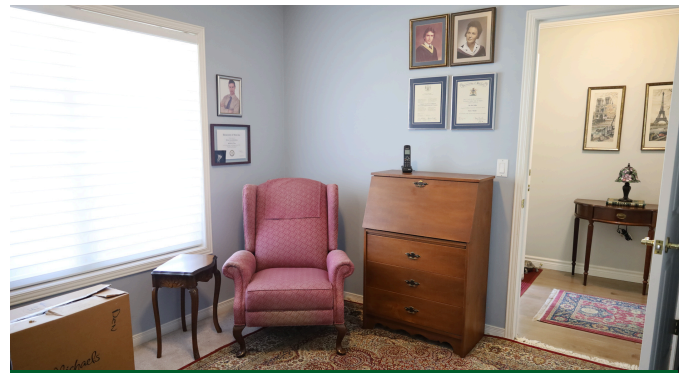
Office / Den / Auxiliary Bedroom