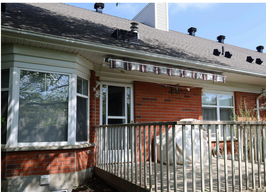
Rear deck for outdoor enjoyment