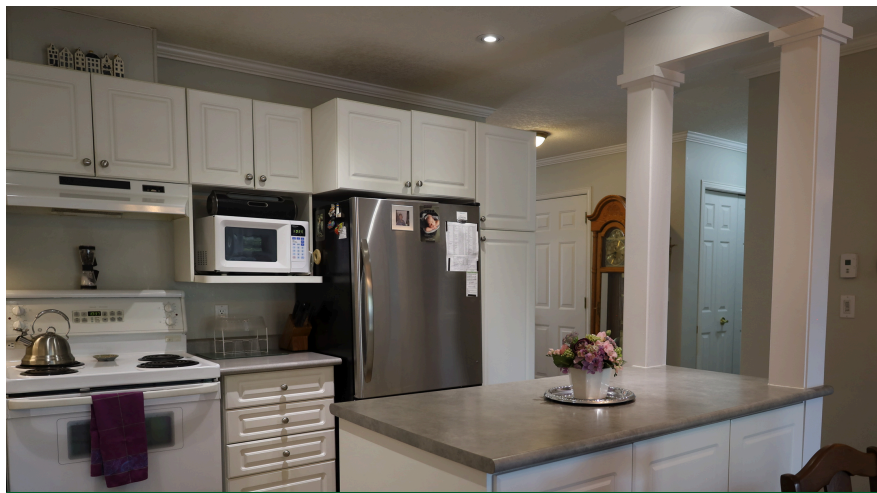
Kitchen with ample storage, including fridge, stove, dishwasher, and microwave