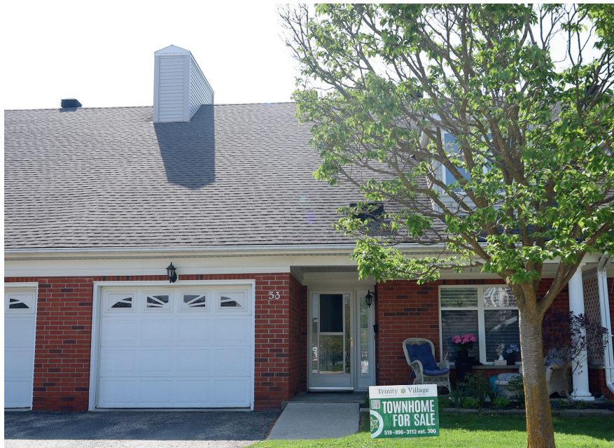
Single-car garage with electronic door opener