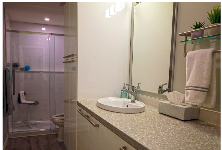
Private caregiver suite with kitchenette and 3-piece bathroom