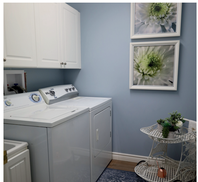
Fully equipped laundry with plenty of storage