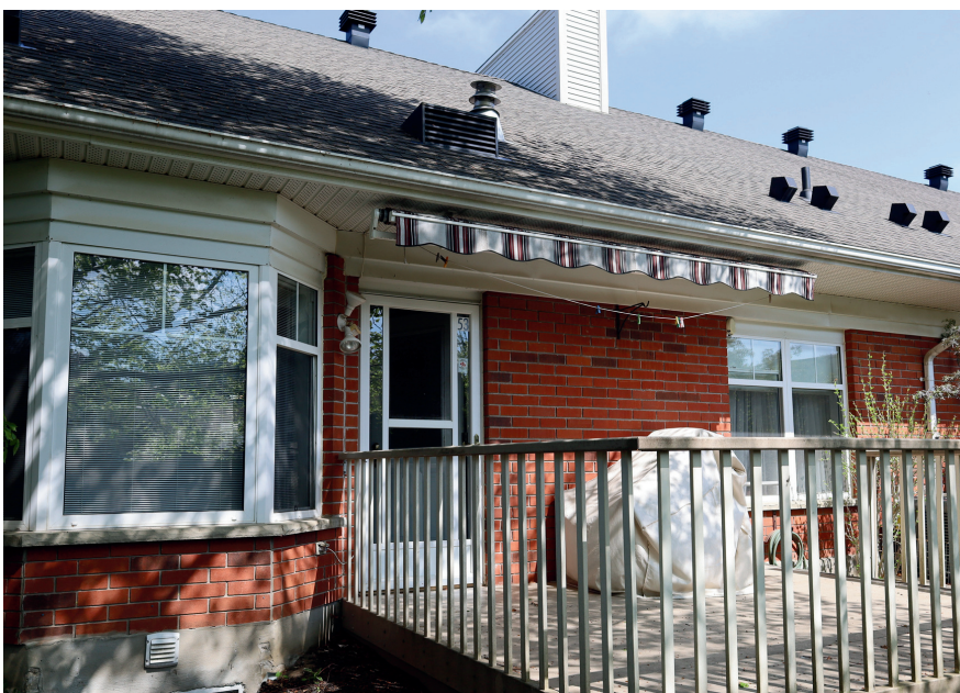
Rear deck for outdoor enjoyment