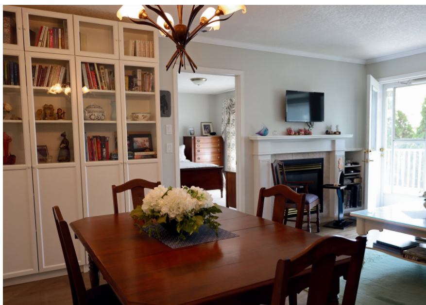
Gas fireplace in the living room for added comfort and ambiance