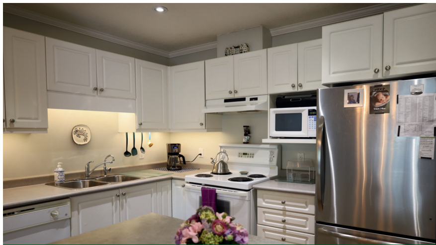
Kitchen with ample storage, including fridge, stove, dishwasher, and microwave